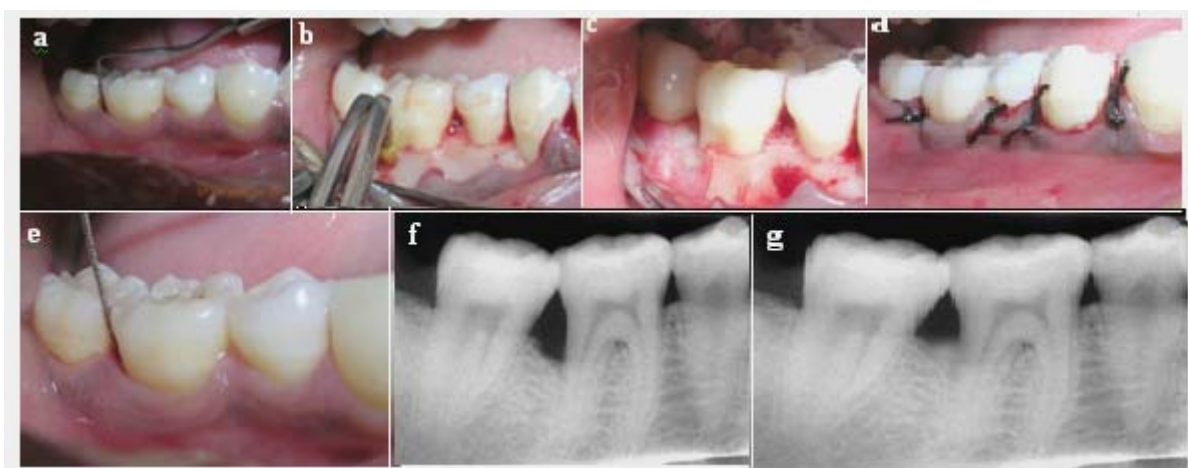
Figure 2. Test group -Guided tissue regeneration with tetracycline root conditioning: a) pre operative probing depth b) tetracycline root conditioning c) healiguide collagen membrane placed d) sutures placed e) post operative probing depth f) pre operative radiograph at baseline g) post operative radiograph at six months