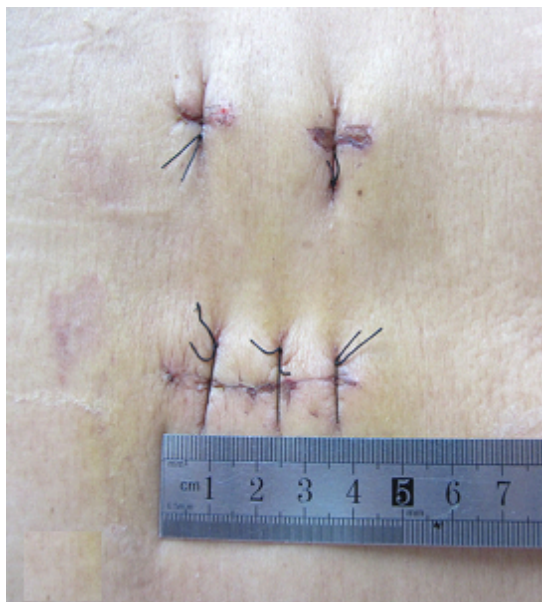
Figure 5. Sagittal 3-dimensional CT reconstruction image of the lumbar vertebra one year post-surgery shows bone bridge formation between L4 and L5 vertebral body, and fusion of intervertebral space in a patient undergoing MIS-TLIF.