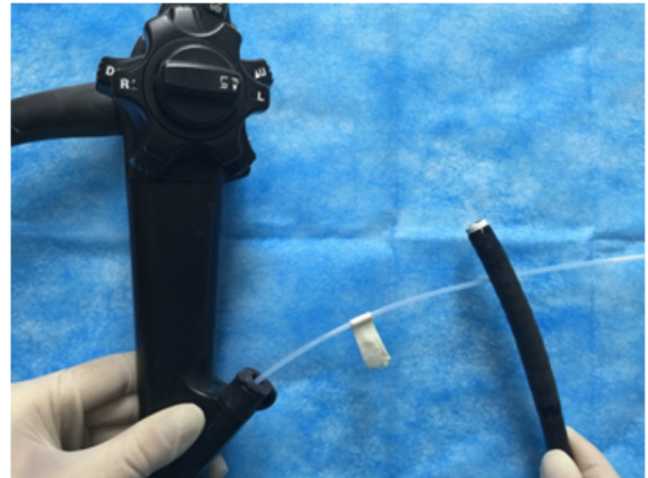
Figure 2. The distance over 5 cm away from the entrance was marked.

All the statistical analysis was conducted using SPSS17.0 software (SPSS Inc., Chicago, IL, USA). The continuous and categorical data were presented as mean (range) and percentage, respectively. The differences of these data were tested by using independent student t-test and chi-square test when applicable. A two tailed P value less than 0.05 was considered to be statistically different.