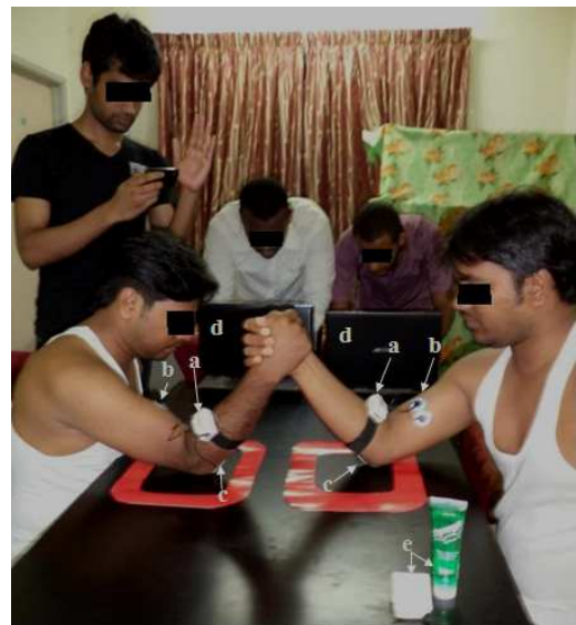
Figure 1. Experimental setup for EMG data recording: a) wireless EMG sensor attached within the daughter board; b) active electrodes; c) reference electrodes; d) Bluetooth-enabled laptop computers for recording the EMG signal within a 2 meter range; e) skin cleaning gel and alcohol swabs.

Ten healthy right-handed male subjects were participated in this experiment. The mean and standard deviation of the age, height, weight, and arm dimension during relaxation and during extension of the participants were 24.5 \pm 3.5 years, 168 \pm 6.7 cm, 70.5 \pm 8.3 kg, 11.82 \pm 1.5 inch, and 13.3 \pm 0.8 inch, respectively. The study was approved by the university research and development review board for human subjects. The ten subjects were divided into five pairs. The demographics characteristics of the two players in each group were almost identical. All participants gave written consent to take part in the study.