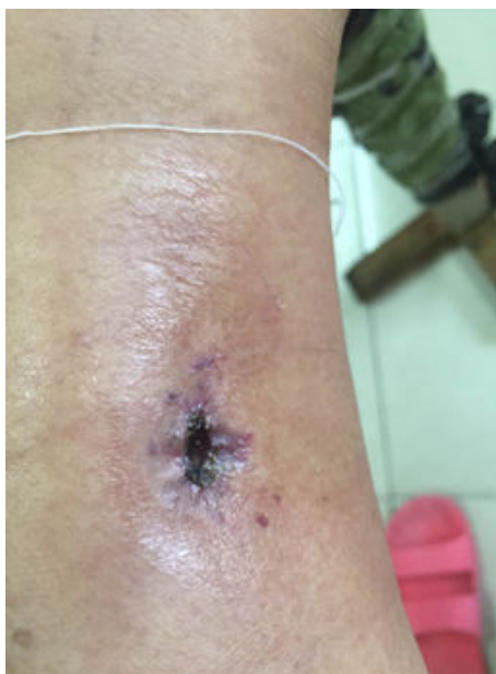
Figure 6. Wound healing.

The PRP is produced through the centrifugation of blood from patients. Therefore, PRP is very safe with high histocompatibility. In addition, the preparation of PRP is simple. However, the most important thing is, compared with the VSD therapy for the treatment of sinus wounds, the liquid PRP can be directly injected into the sinus and contact the sinus surface adequately regardless of the wound depth which makes full use of the contained cytokines. Generally, the PRP exhibits notable therapeutic effects for the treatment of refractory sinus wounds which provides a novel and effective way for similar wound healing in clinical treatment.