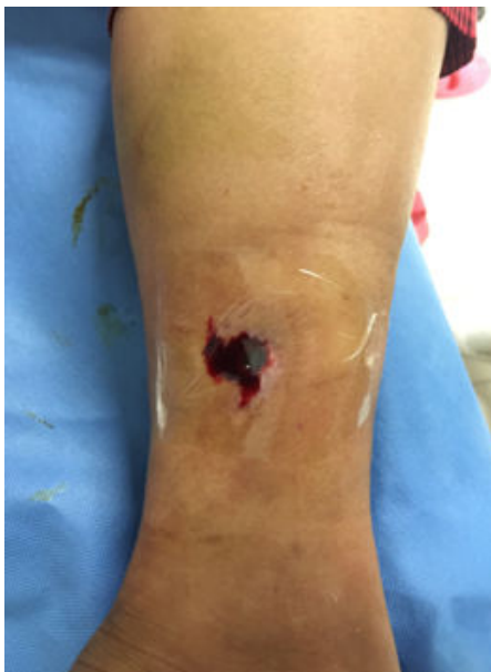
Figure 5. Cover the wound with sterile transparent membrane.

similar results have also been reported [8,17-19] which further confirm the significant therapeutic efficiency of PRP.