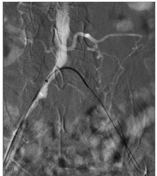
Figure 2. Loach guidewire head into "U" shaped loops assisted the super slippery catheter through occlusion segment.

Selected the appropriate blood vessel puncture depending on the lesions. For TASCII-D aortoiliac artery and TASCII-D complex lesions of iliac artery, contralateral femoral artery puncture or joint brachial artery, ipsilateral distal retrograde femoral artery puncture generally could be chosen [11]. Of the patients in this study, 11 cases were performed contralateral femoral artery puncture "crossover" to process the ipsilateral iliac artery and groin following arterial occlusion, the guide wire into a loop was used to assist catheter "crossover" the long-segment occlusion iliac artery technique, as shown in Figures 1-4 (the same patient). The other four cases were associated ipsilateral brachial artery puncture, five cases associated ipsilateral femoral artery retrograde puncture.