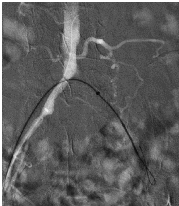
Figure 3. Loach guide wire continue to shape into a loop to assist the entering of catheter and "crossover" sheath.