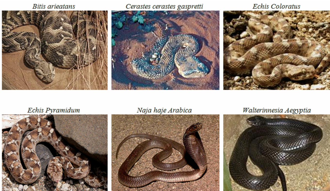
Figure 1. Snake species used in this study.

In conclusion, each snake's venom has a unique chromatographic profile that can be used as a fingerprint to differentiate one species from the other. Our findings suggest that gel filtration chromatography of snake venom is a simple and reproducible method for identification of snake species.