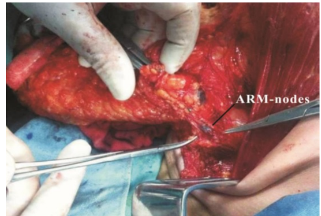
Figure 1. ARM-nodes.

(ARM-nodes, Figure 1), the majority of patients owned one node, and small number of patients owned 2-3 nodes, with an average of 1.12 \pm 0.78 , total of 31 ARM-nodes. Routine pathological examination showed that one ARM-nodes had isolated cancer nest and the remaining ARM-nodes were negative (Table 2); Most ARM-nodes were located in angle area 2 cm away of axillary vein and subscapular artery outside (Figure 2: A Area), and small part was located in axillary vein top level or the area near to head vein into axillary vein (Figure 2: C, D areas).