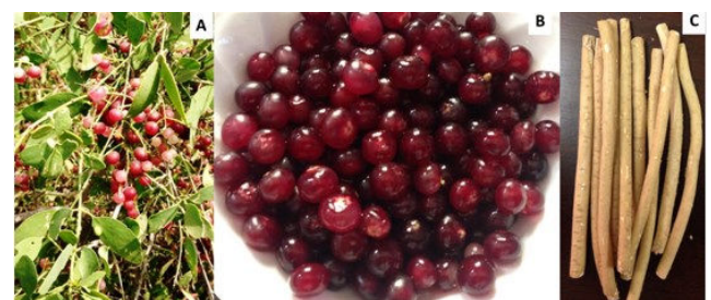
Figure 1. Salvadora persica tree; A: Twigs with fruits, B: Fruit and C: root.

Fresh and healthy root, fruit, and twigs of the plant S. persica were collected from local farms in Hali centre, Alqunfudah city, province of Makkah, Saudi Arabia (Figure 1). The collection of the plant component was undertaken in June 2014.