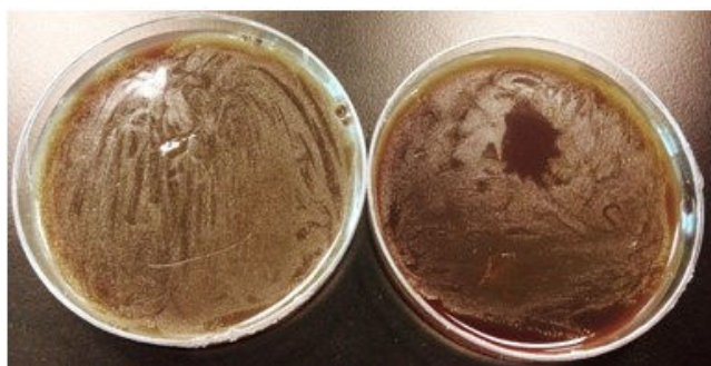
Figure 2. Antimicrobial activity of Salvadora persica extracts on pneumococcal lawn (Right plate is a control and left plate tested culture which shown a clear zone of inhibition).

Determination of zone of inhibition method: Antimicrobial activity was undertaken using spot test as described by Armon and Kott [15]. 500 µl of exponential growth of strain D39 was added to 3 ml of 0.4% sloppy agar (3.7 g brain heart infusion (BHI) broth base and 0.4 g of agar). The mixture was then poured on BHI agar base, distributed all over the plate, and left on the bench to set. 10 to 20 µl of extract was spotted on the top of pneumococcal lawns, once lawns were made and the agar set. Spotted plates were left on the bench to dry and then incubated overnight at 37°C using an-aerobic conditions. The plates were observed the next day to monitor the presence of zone of killing, which indicate the antimicrobial activity.