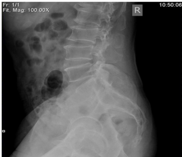
Figure 4. X-ray image of patient with waist injury.