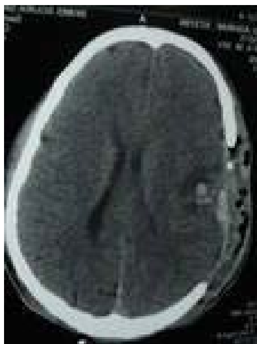
Figure 5: Plain CT Scan brain on the 9 th post dural-stab day shows relaxed brain and resolving contusions.

GCS of only 5-6 (Table 1). While comparing outcome to the age and sex, the dural-stab (case study group) had an overall and better survival of 78.3% (47/60) and a good-recovery of 43.3% (26/60) especially 30% (18/60) good recovery in the age group 21-40 yrs. This proved effective as compared to an overall 40% (24/60) survival and 11.6% (7/60) good recovery in the open dural flap (control group) while age group of 21-40 yrs also showed a