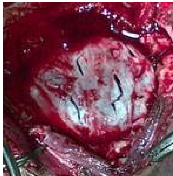
Figure 4: The Stabbed, relaxed, depressed and grayish-blue dura after evacuation of acute subdural hematoma.