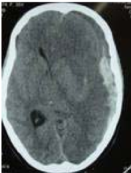
Figure 1: Plain CT Scan Brain shows Acute subdural hematoma with midline shift and obliterated cisterns and ventricles due to severe brain edema.