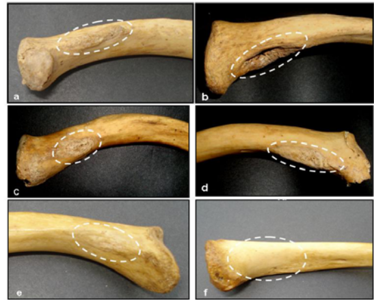
Figure 1: Various patterns of costoclavicular ligamentous impression (encircled) on clavicle. Elevated & rough (a); Depressed & rough (b); Flat & rough (c); Depressed & smooth (d); Flat & smooth (e); No impression (f).

Unlike oval impression of costoclavicular ligament on clavicle, corresponding area in majority of first rib did not