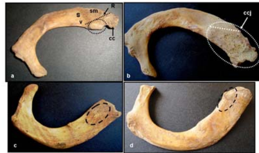
Figure 2: Various patterns of costal attachment of costoclavicular ligament (encircled). Elevated & smooth (a); Elevated & rough impression on first rib & its ossified costal cartilage (b) Flat & rough (c) Flat & smooth (no impression) (d). [R- Oblique ridge on elevated areas separating the area of attachment of costoclavicular ligament and Subclavius muscle (sm); cc- ossified first costal cartilage; ccj- costochondral junction; Sv- groove for subclavian vein]