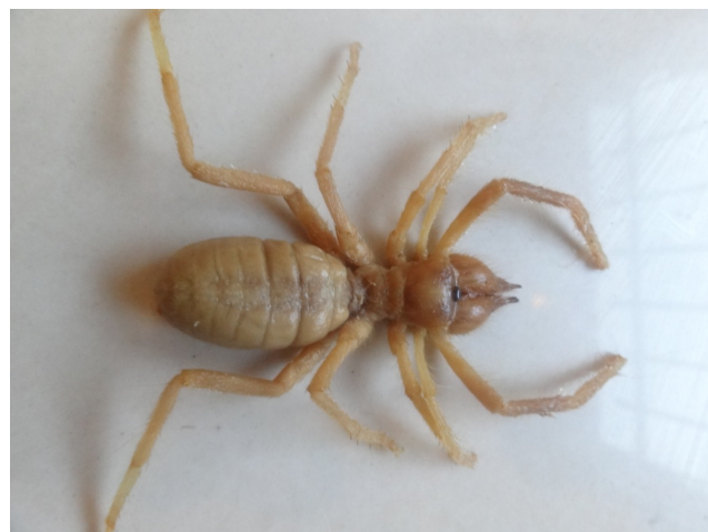
Figure 2. The dorsal part of the species Gylippus lamelliger , Kashan City, Central Iran.