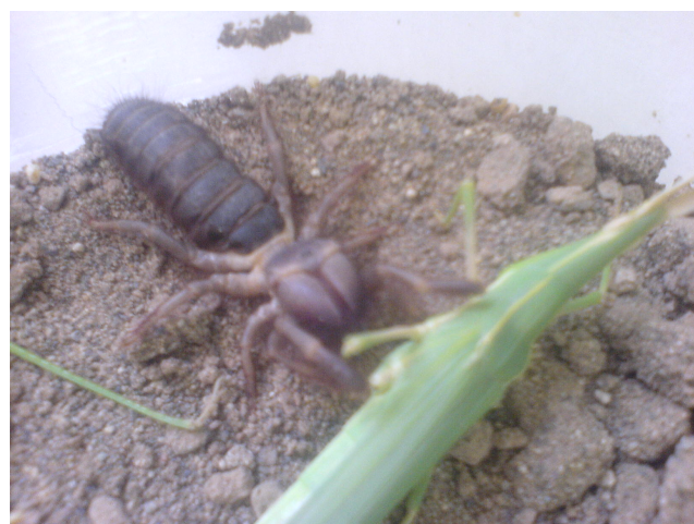
Figure 3. A living specimen of the species Rhagodes melanochaetus while feeding, Kashan City, Central Iran.

The highest number of solpugids, that is, almost 40% of them were collected from around the dormitories of Kashan