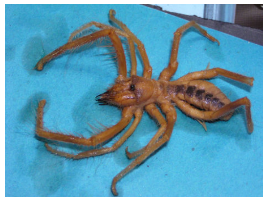
Figure 1. The dorsal of the species Galeodes caspius , Kashan City, Central Iran.

(Figure 2) and 7.5% Rhagodes melanochaetus (Figures 3 and 4).